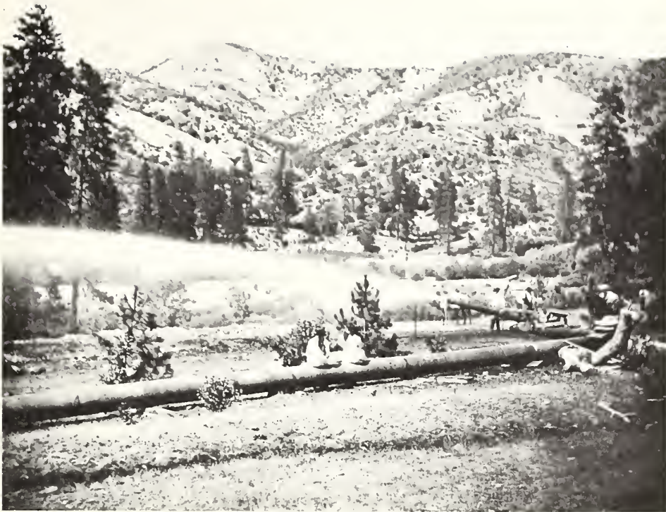
Figure 2. Late nineteenth-century hydraulic mining scene, probably the "Gin-Lin Company" operation near the mouth of the Little Applegate River.

excavations account for the remainder of the sites. Hydraulic cuts will be found along the margins of medium-to-low excavation stream courses. Of the inventoried sites, four fall within Standard CFL. The remaining two are located in the Non-Forested, Unproductive and Unregulated classes.